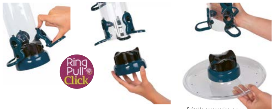
▲ Fig. 2: ultra

Suitable accessories, e.g. » Feed Plate can be found on page W6.