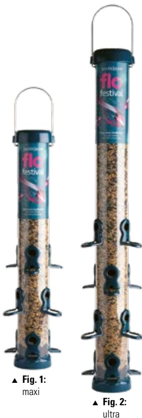
▲ Fig. 1: maxi

Dimensions: ø 8.5 cm. Height: 102 cm (with bracket). Contents: 5.2 l. Order No. 00 511/3