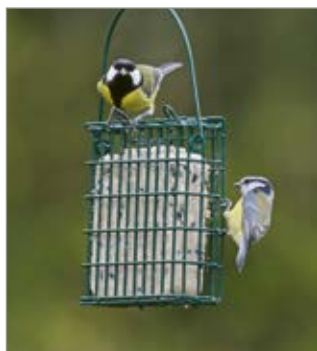
▲ Suet Cake Feeder see Page W11